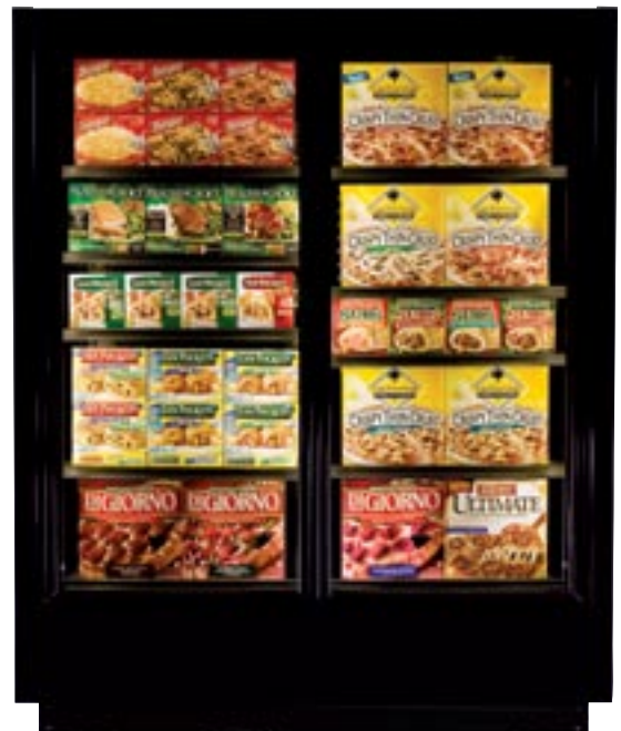
Affinium LED Lighting System